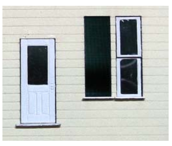
Front view of both sash in place and also a door. Note the sills again.

20. Allow each of your windows and doors to dry totally before proceeding with the trimming out. Some window and/or door products come with their own trim, others do not. If yours do not have laser cut trim you can use stripwood. 1x4, 1x5 or 1x6 make acceptable trim. Paint or stain all stripwood trim before attempting to apply it to your windows or doors on the walls.