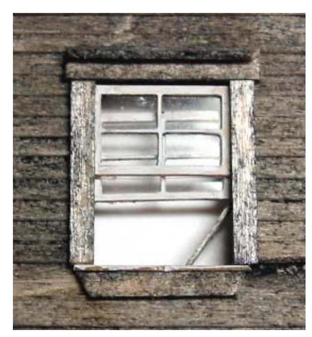
The above finished window shows a double sash with a stick proping the lower sash open. Also note the addition of a second piece of trim across the top of the window as a drip cap. This piece is laid almost flat, slight angle so water would run off.

26. The last piece of trim needed is the top trim piece. Here you can have it's ends even with the outside edges of the side trim pieces or even stick out a few inches further on each side. The choice is yours and should be done in conjuction with the style and period of your building.