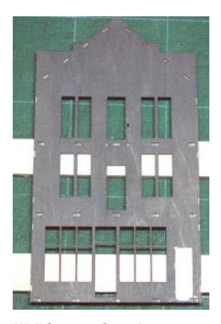
Wall Support Sample.

13. Place your wall piece face down on your work surface and be sure to insert a