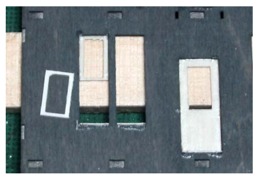
This photo shows both an upper sash installed and also a door. Note the small drops of glue at the bottom edges of the sills.

midpoints where the sash touches the wall frame. Use very small drops of glue and be careful not to get the glue out on the exposed area of the acetate glazing or it will be visible from the outside of your building.